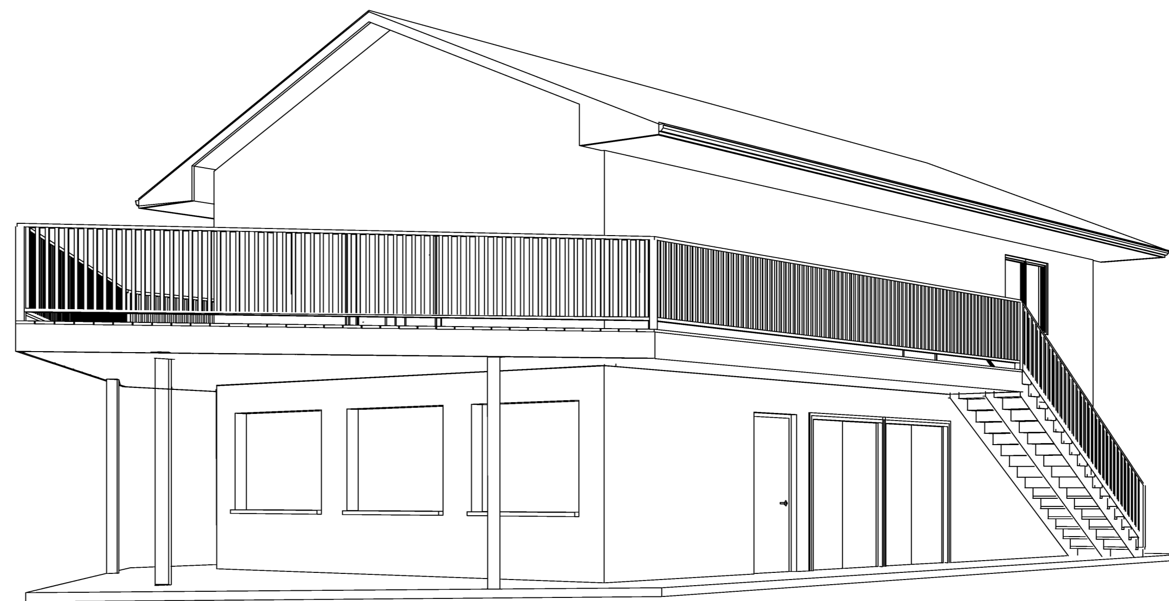
VIEW FROM SOUTHEAST

© COPYRIGHT These plans and designs depicted therein, including but not limited to, the overall form, arrangement and composition of spaces and elements of the design, are protected under Copyright Laws. Collectively they are the property of Thomas W. McCoy. Any copying or other unauthorized use can result in the cessation of such construction or the demolition of such resultant construction.